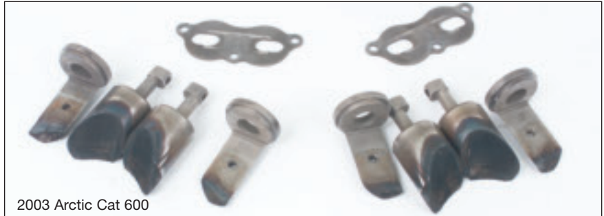
2003 Arctic Cat 600

Subjected to adverse field testing conditions in the Rocky Mountains, including long trail rides, high-RPM powder riding and steep hill climbs, AMSOIL INTERCEPTOR™ demonstrated superior wear protection and outstanding deposit control.